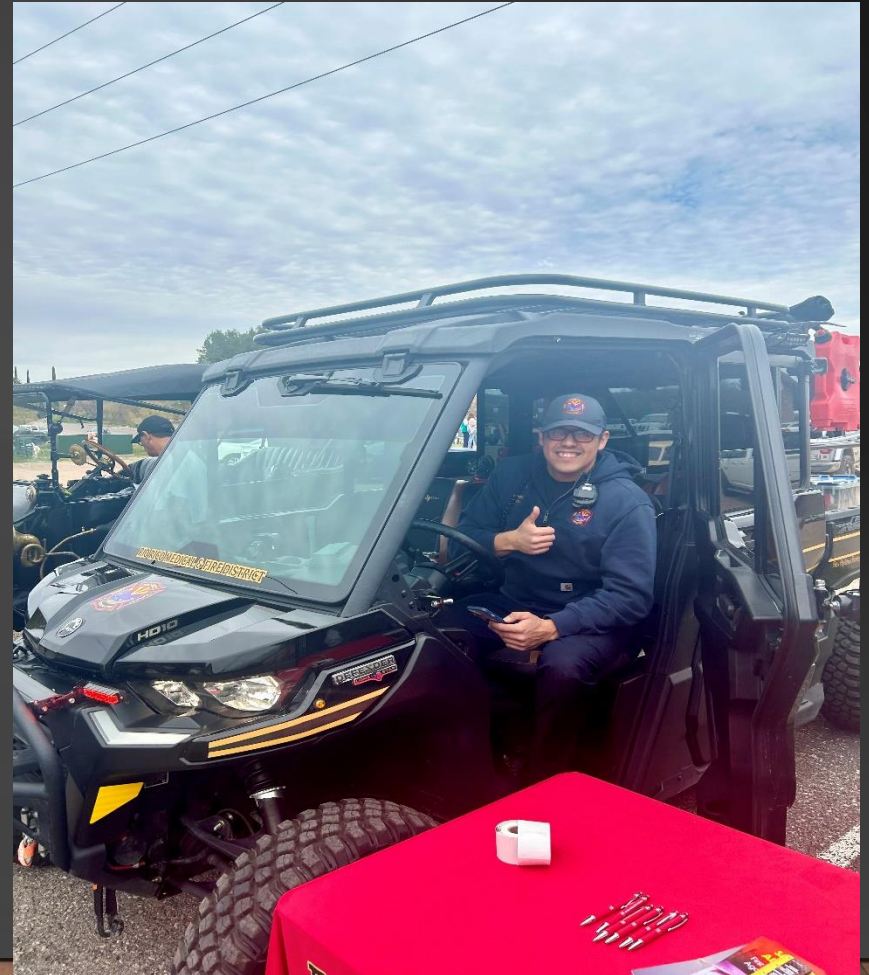
RIO RICO KNIGHTS OF COLUMBUS CAR SHOW